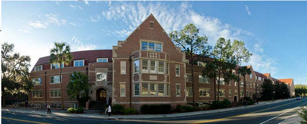
Weil Hall, University of Florida, Gainesville