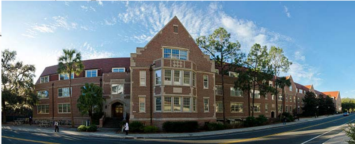
Weil Hall, University of Florida, Gainesville